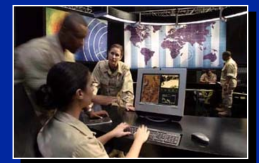
Architectures, Simulation, and Visualization