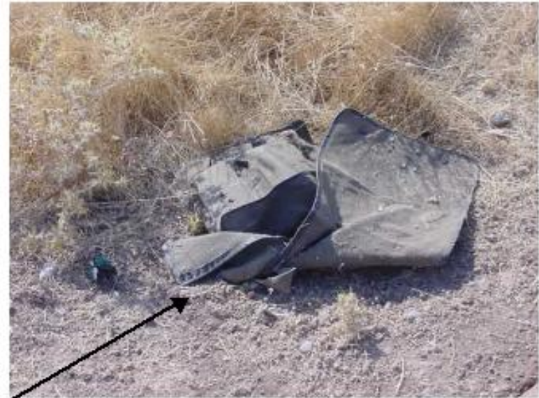
RPG Satchel Bag & Elements