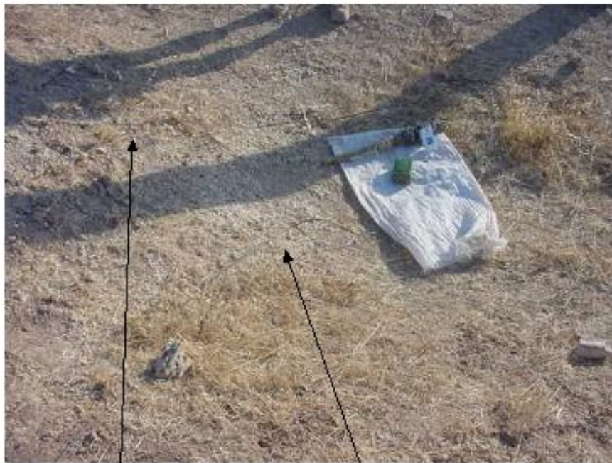
Wires from both IEDs